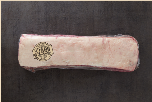
Vacuum Packed product

Block Packed: The product is solid packed into a carton. Contains a polyethylene sheet or bag to protect the product. For frozen product only.